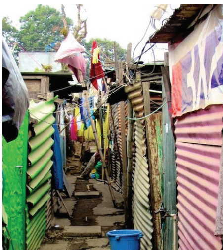
"Homes" in La Limonada