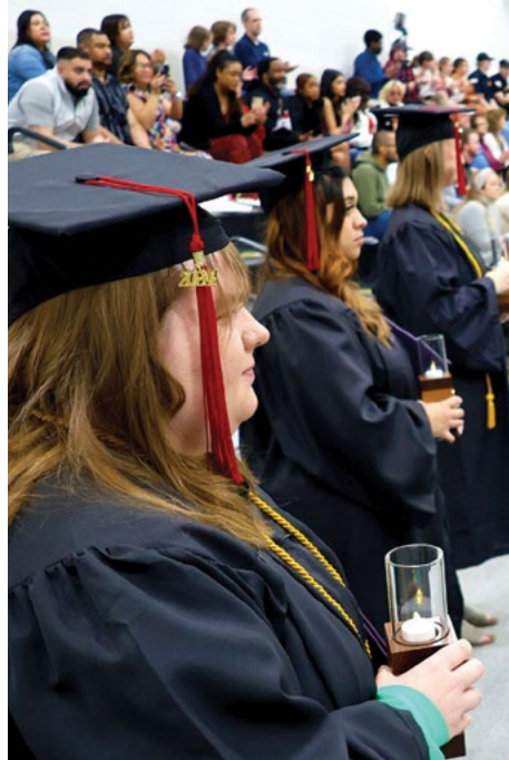
The Class of 2024.